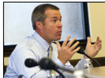
Mayor Wyatt Bunker