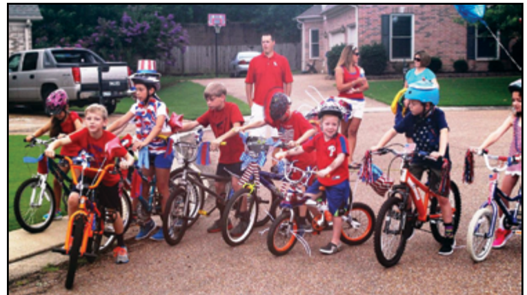
Windward Slopes 4th of July Parade

5335 Saffron Springs Dr. Lakeland, TN 38002 Cell: 901-340-0261 Cell: 901-734-5665 Rich0302@gmail.com