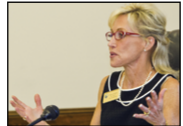
Mayor Sherri Gallick