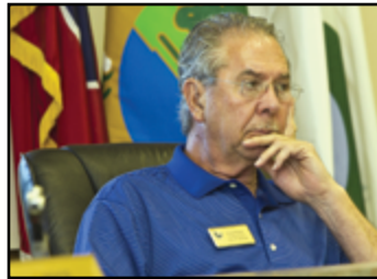
Commissioner Clark Plunk