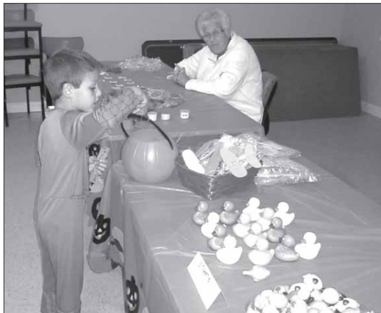
Spiderman visits the "Halloween Carnival Store."

The City of Lakeland and the Parks & Recreation Department offers a special thanks to all volunteers, including City staff that volunteered their own personal time to make the event such a success again this year!