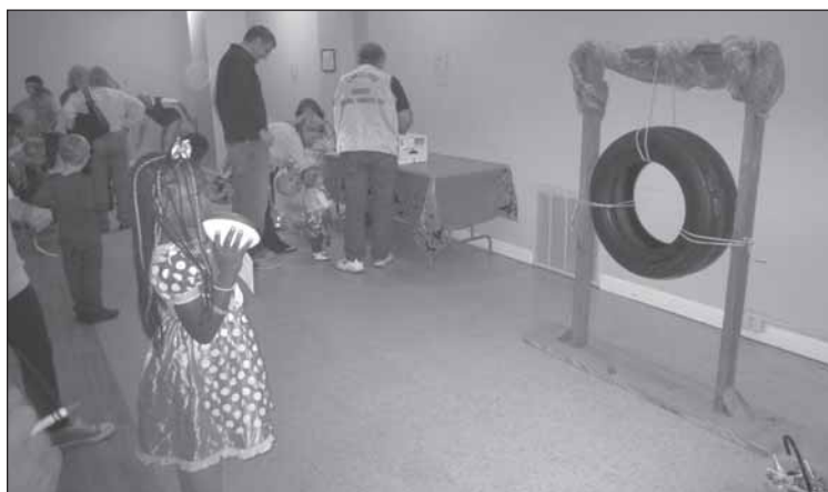
Carnival participant taking aim at the goal, i.e., to get as much candy as possible.