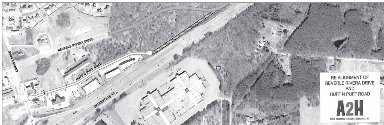
Map of changes to Huff N Puff/Beverle Rivera to Seed Tick. Work to start summer of 2014.

Just a few more months and work will begin on Beverle Rivera and Huff N Puff Roads to extend to Seed Tick Road. The long awaited traffic fix at Canada Road near I-40 commences in May 2014 with bid opening with construction to start in June or July 2014.