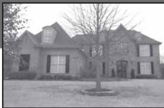
4 bed+bonus, 3 car garage $380,000