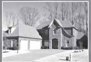
4482 Coltwood Oakwood $375,000