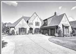
10076 Carly Winstead Farms $439,000