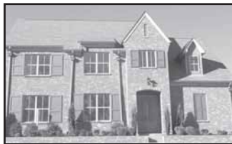
New Construction 5 bed+office +bonus, 3 car garage $500,000