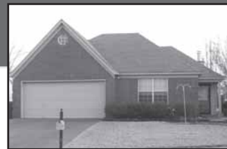
3 bed/2 ba + bonus near golf course $140,000