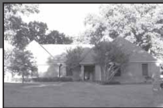
Golf Course Lot One level 4 bed/2ba $190,000