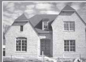
4614 Maple Glen Ct. The Grove $353,880