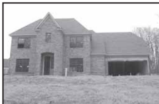
New Construction 4 bed/ 2.5 bath $255,000 ... Make your selections!