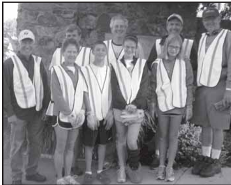
Volunteer clean-up crew for Herons Ridge.

We encourage all homeowners to become a member of our website www.heronridgehoa.com as we as join our Facebook page. This will keep you up to date on all events in the neighborhood and your community.