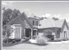
10246 Gillespie Oak Oakwood $385,000