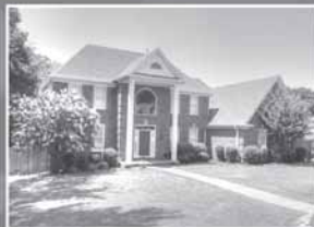
4305 New Canada Road Woodbridge $289,000