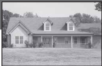
2 acre lot 4bed/3ba $195,000