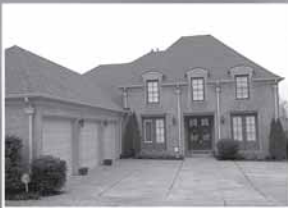
10200 Ivy Oak Oakwood $429,000