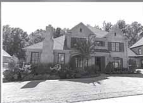
10225 Oak Levee Oakwood $437,000