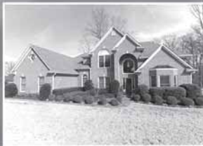
4460 Ravenwood Oak Oakwood $409,000