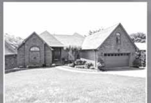
4083 Cedar Point Road Lakeland Estates $344,900