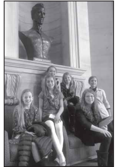
LES students at the State Capitol.