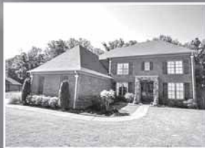
10197 Oak Levee Oakwood $434,900