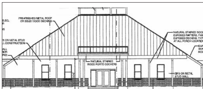
Rendering of the structure for the Winery.