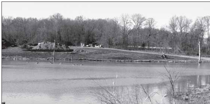
Site for the Winery in the northern section of Lakeland

"We're taking a chance," said Jim, of the multimillion-dollar investment. "But our goal is to have the premiere winery in the state, and I think we can pull it off."