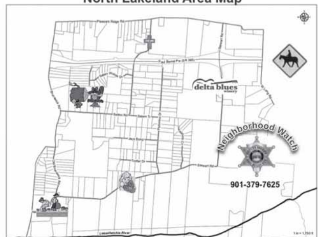
Map showing the location of the Delta Blues Winery in Lakeland.