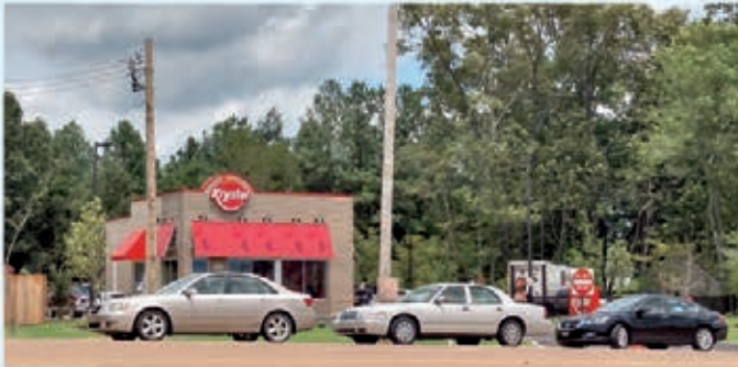
Krystal-time began in Lakeland July 5 when the restaurant opened at 9986 U.S. Highway 64 to standing-room only crowds. The eatery, just east of Canada Road is managed by Shaun Suggs who anticipated a grand opening the end of July

More details to follow or contact Kim Odom.