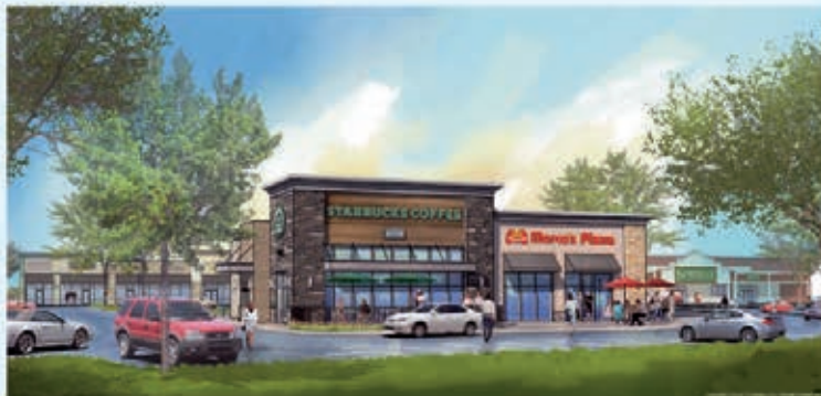
Rendering of Starbucks and Marco's Pizza, new out-building in Country Bridge Shopping Center on U.S. Highway 64.

The one grocery in Lakeland, Sprouts Farmer's Market, began wine sales July 1. Local wine is available at Delta Blues Winery at 6585 Stewart Road in Lakeland.