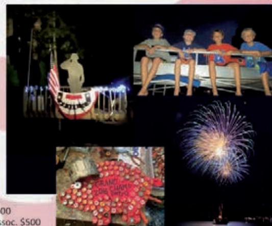
...thanks to all the sponsors who made this event possible. See you next year!