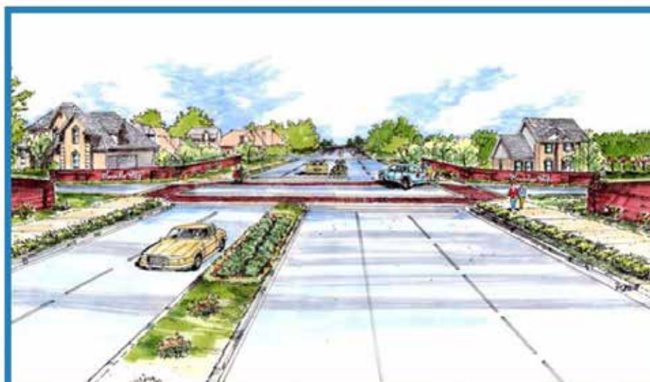
Rendering of intersections, crosswalks, enhanced entrance features and brick fencing

Much has been said about the development of New Canada Road (NCR) based on conjecture and false information. Some residents living in the neighborhoods near the project believed it would never be built. Some residents do not know of the Road though there is clearly a plan that was started in 1992. But the project is indeed moving forward. Emily Harrell, city engineer, shared details of the Road.