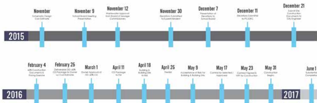
Project schedule for Lakeland Middle School